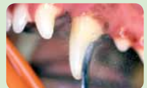
Removing the calculus using an ultrasonic scaler, followed by polishing the teeth is a very effective form of treatment