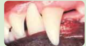
(1) Healthy mouth